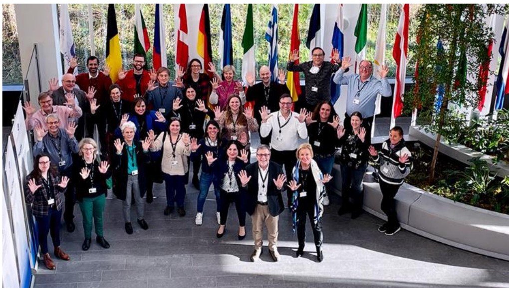
COMP members celebrating rare diseases day 2023!

Read here the full work plan for more information.