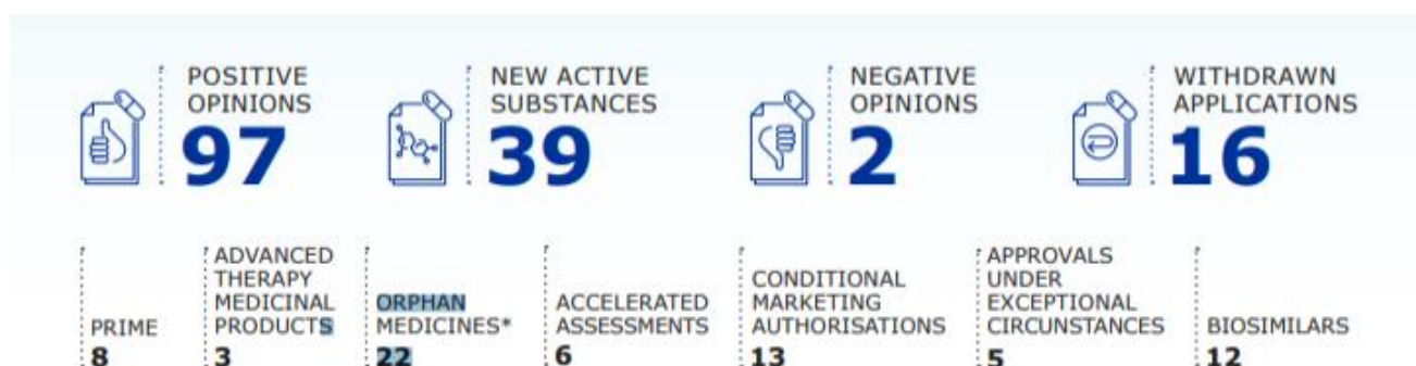
Image adapted from EMA highlights 2020

For more information, see the EMA highlights 2020 .